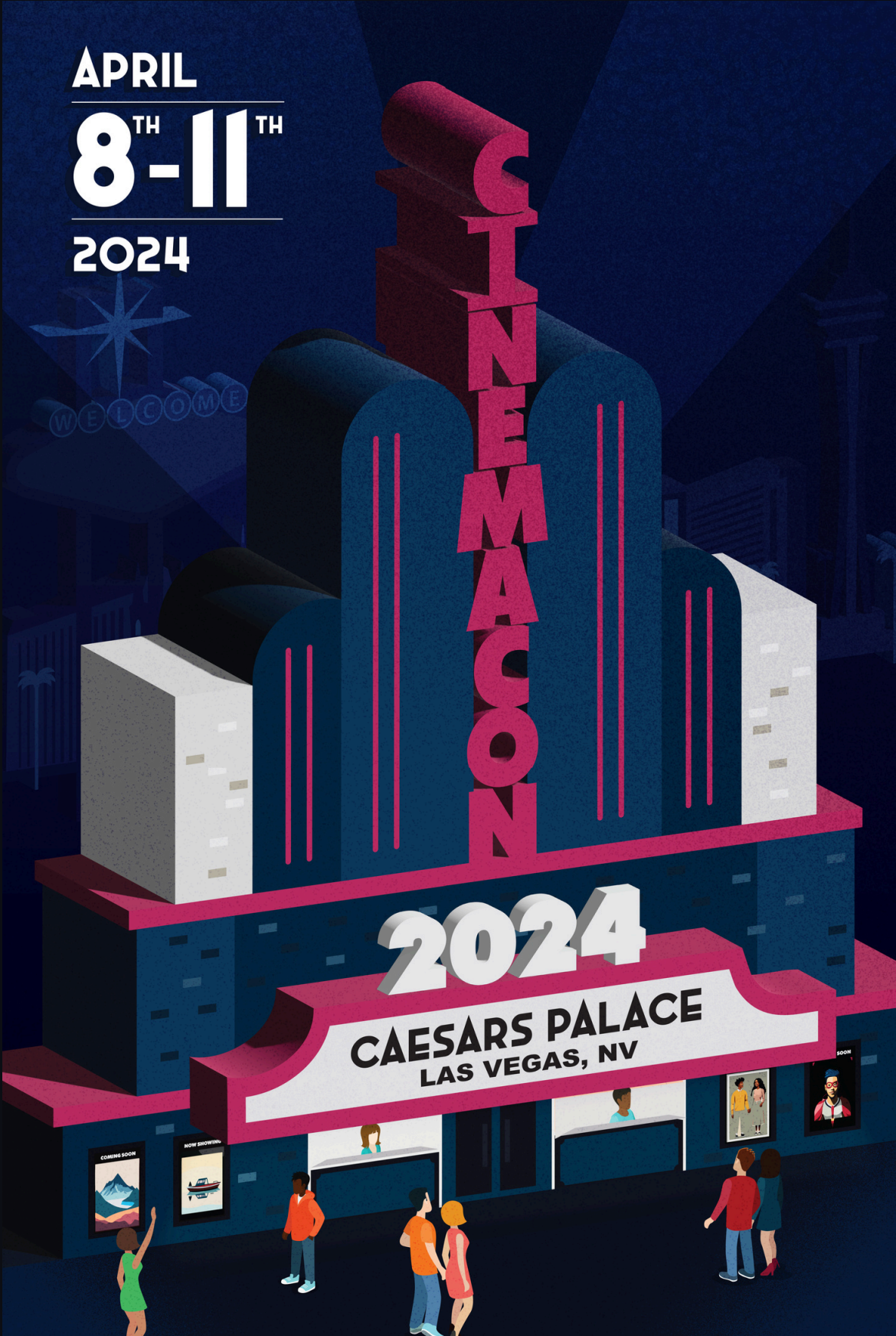
ARTIST: PATRICK STICKNEY | THEATER: CLASSIC CINEMAS – ELK GROVE VILLAGE, IL POSTER TITLE: GRAND EXTERIOR